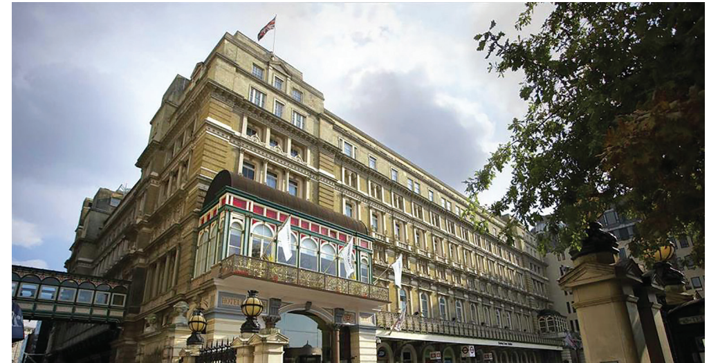
Amba Hotel Charing Cross