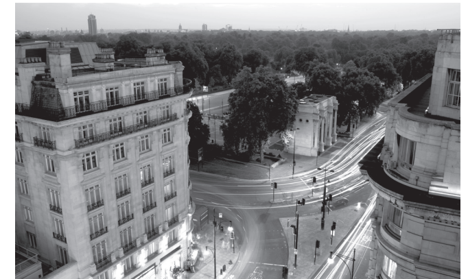
Views from Amba Hotel Marble Arch

We offer a personally tailored service designed to compliment your taste and style.