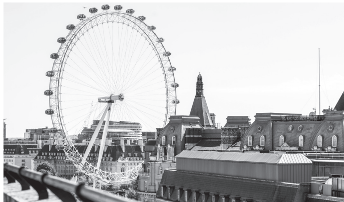
Views from Amba Hotel Charing Cross

We can arrange absolutely everything for you from stunning rooms to the food, drink, music, flowers – even offering you special hotel room rates for your guests.