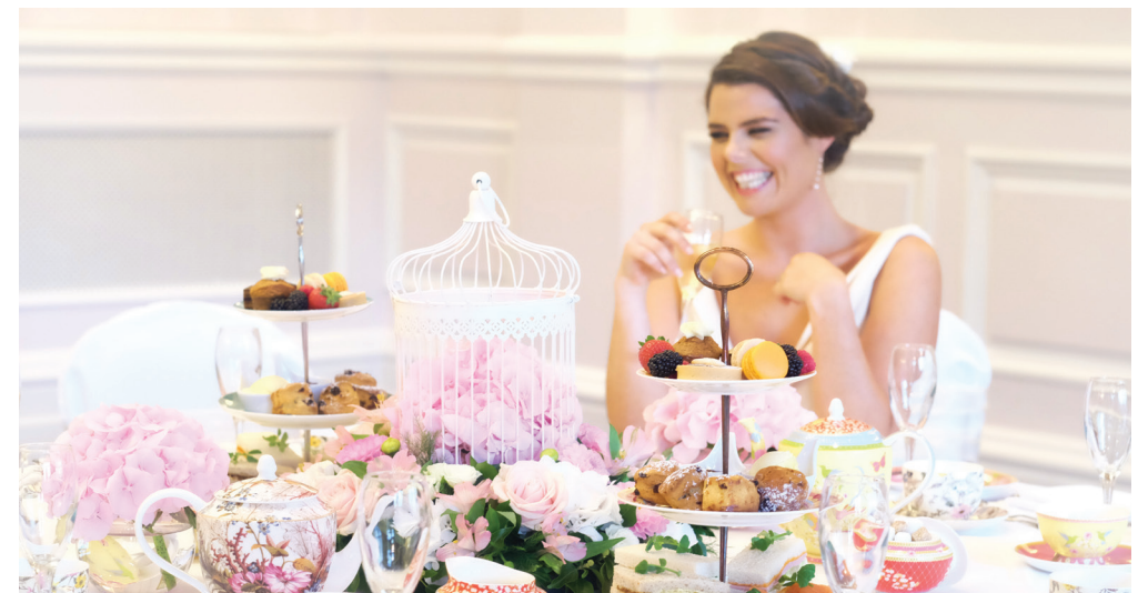
The Vintage Tea Party One - (Wedding dress by Motasem)