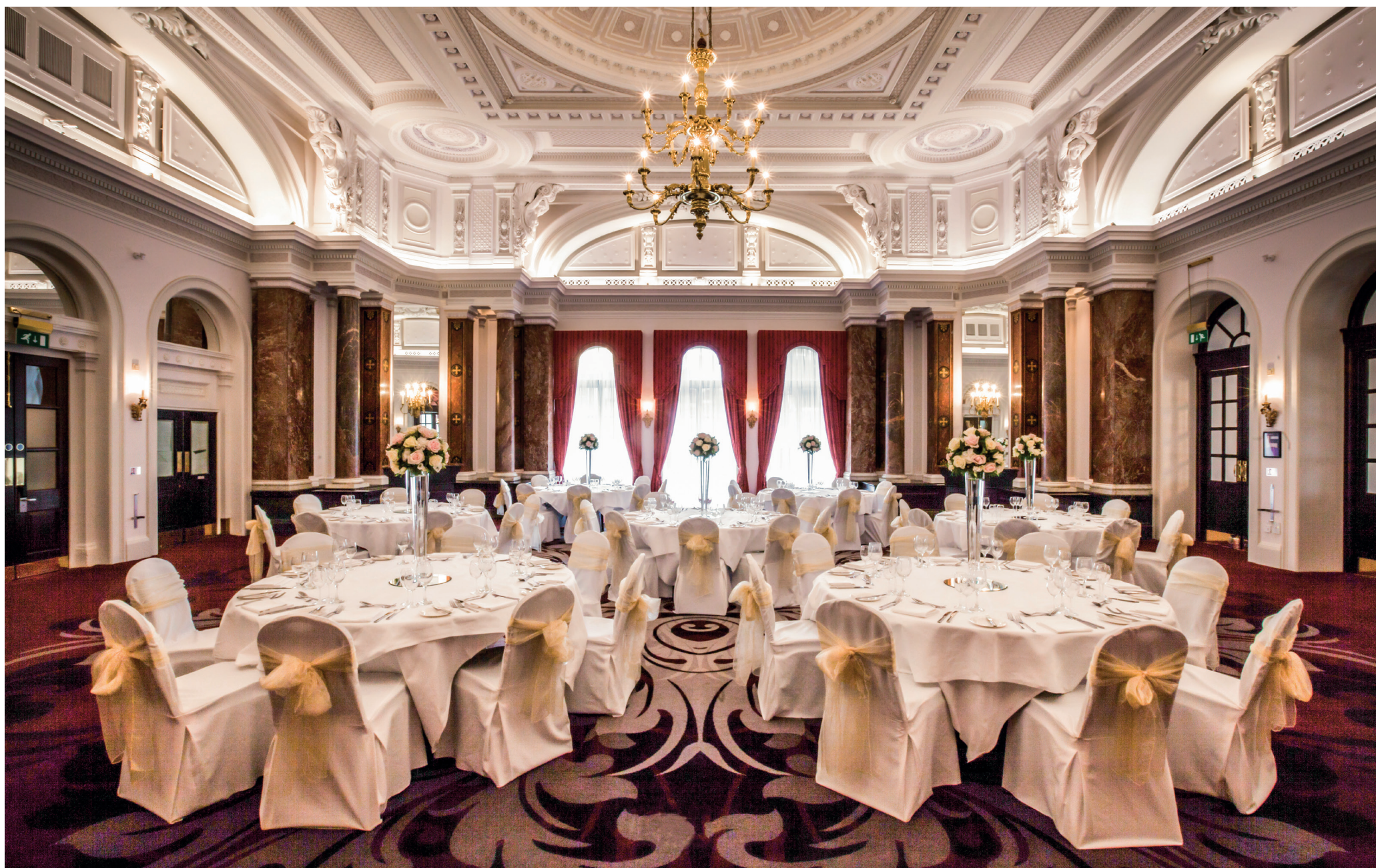
Celebrate your day in the stunning Ballroom suite, recently renovated to show off the classic Victorian architecture; perfect for the first dance