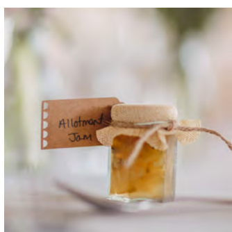
Clockwise from top right: 1. Caro Hutching, 2. Paul Fletcher 3 & 4 Zest Photography