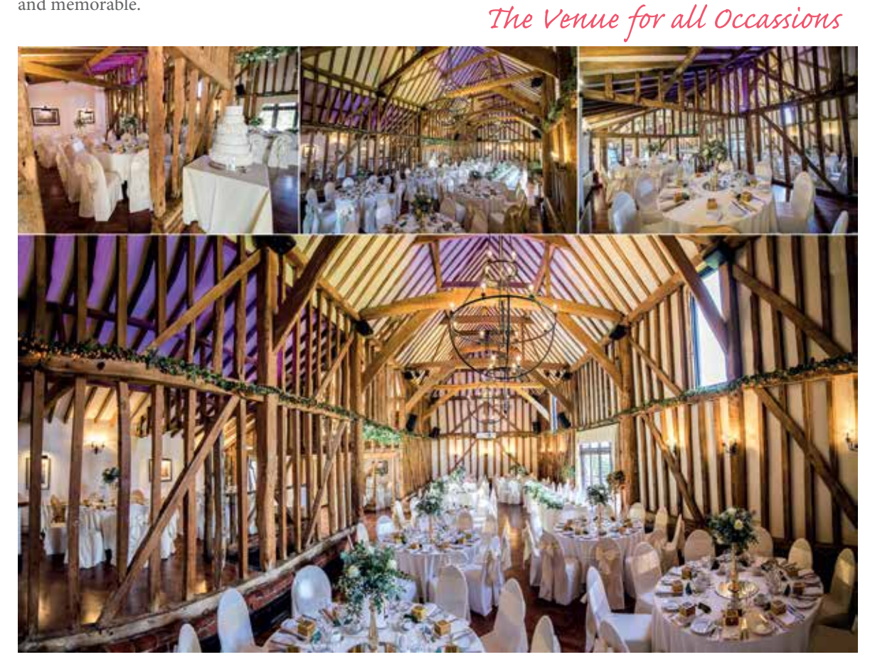
The Baronial Hall showing 148 place settings

Our staff are warm and accommodating and will be delighted to ensure that your visit will be relaxed, happy and memorable.